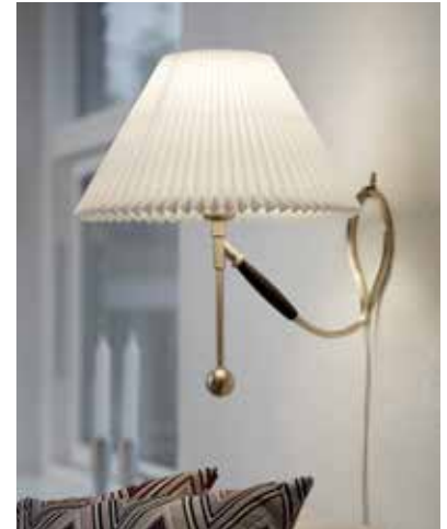
MODEL 306 Design: Kaare Klint

Masterpieces Made to last for generations