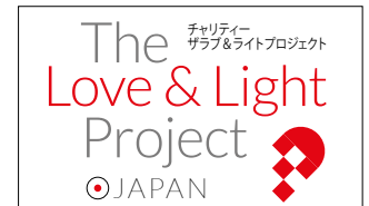
250 Candlelight lanterns were donated to terminally ill children, hospitalized in Japan