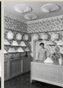
Lise Le Charlotte Klint in Copenhagen Store