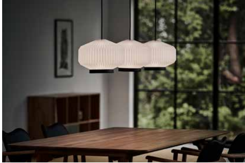
SHIBUI · Design: Søren Refsgaard