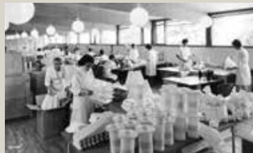
Made in Odense since 1943