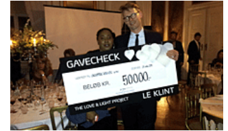
Children Center, Fyn, Denmark, 2015