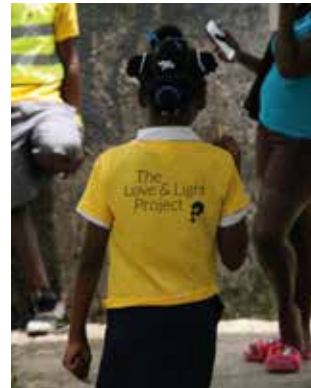
Three schools, Portland, Jamaica 2017