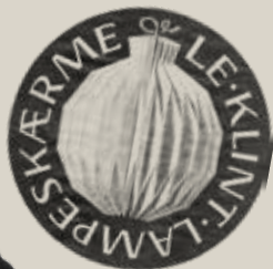
The first lampshade 1901