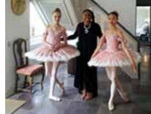
Royal Danish Ballet School, 2014