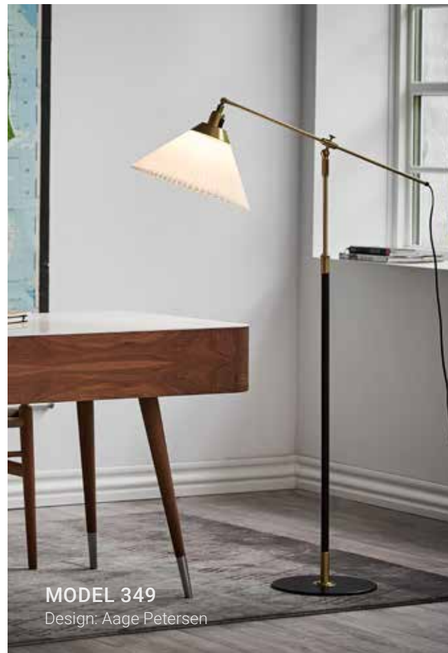
MODEL 349 Design: Aage Petersen