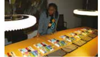
Minerva Women Centre, London 2013