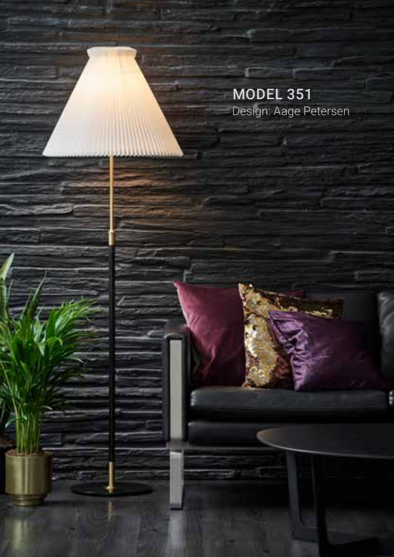
MODEL 351 Design: Aage Petersen