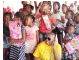
Palenque de San Basilio, Colombia 2019

Every year a percentage of the profits from the sales of the Christmas Collection is donated to help someone or an organisation with limited funds that gives back to its community, regardless of destination or race. Buying a Seasonal Fold is the lifeline of The Love & Light Project.